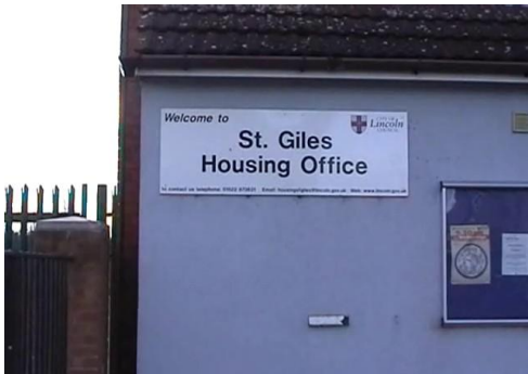
“City Council Housing Office”

The City Council has a presence on the estate which is a very useful base on which to build. The local estate officer has a good relationship with the local community as well.