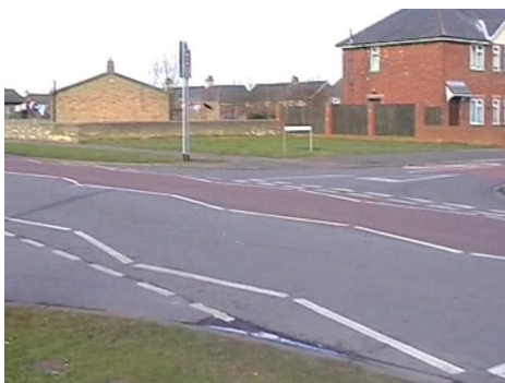
“Traffic speeding on Outer Circle Drive”

Outer Circle is the main thoroughfare for traffic passing through the estate and is wide enough to attract dangerous driving. Although there have been recent attempt to restrict this, local feeling is that it doesn't go far enough