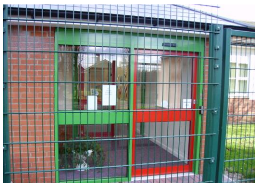
St Giles Family Centre

Across the road are a couple of buildings run by different agencies