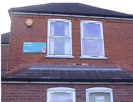
“Former Sure Start building”